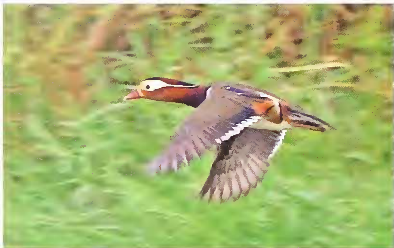
Plate 3. Adult male Mandarin Duck Aix galericulata , fishpond near Laoag, Ilocos Norte, Luzon, 18 December 2013.